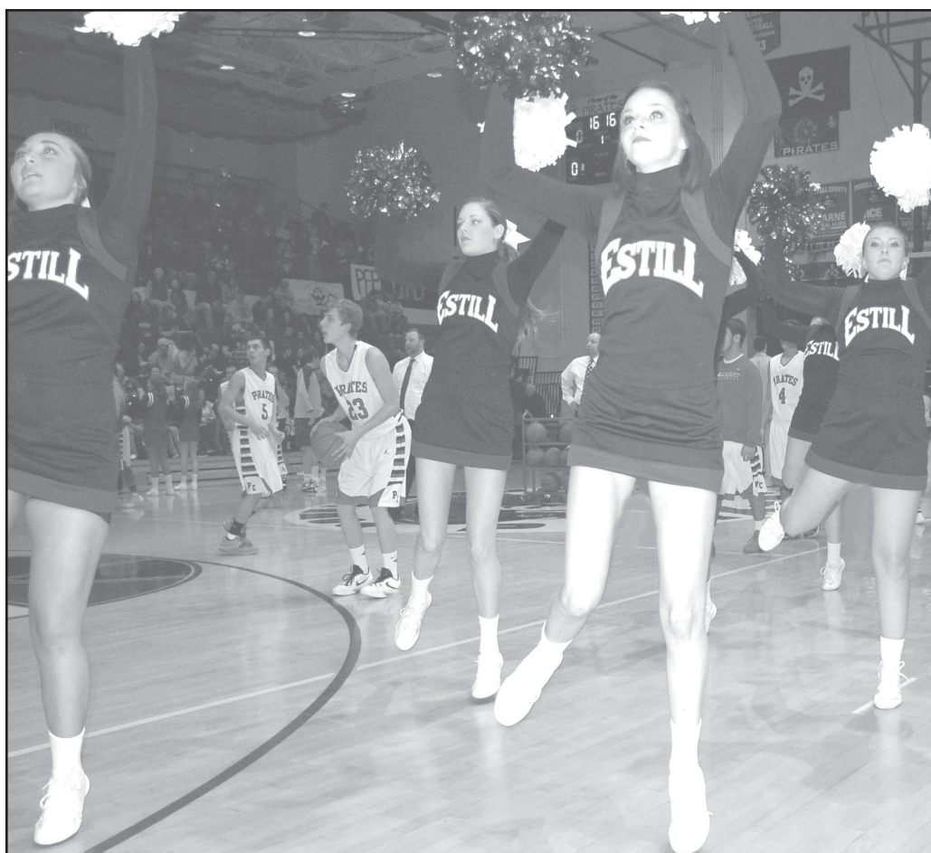
Estill Engineers cheerleaders perform at the districts