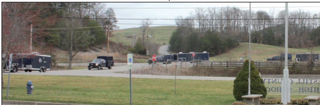
The Kentucky National Guard 41st Civil Support Team brought a convoy of navy blue trucks and trailers with their testing equipment to the landfill Saturday morning.

Advanced Disposal Systems Blue Ridge Landfill, Inc. was served with a notice of violation by the state's Energy and Environmental Cabinet on Tuesday, March 8. The notice says the landfill was in violation in four areas after accepting 47 loads of NORM from July through November, 2015. The landfill can be fined up to $25,000 per violation occurrence.