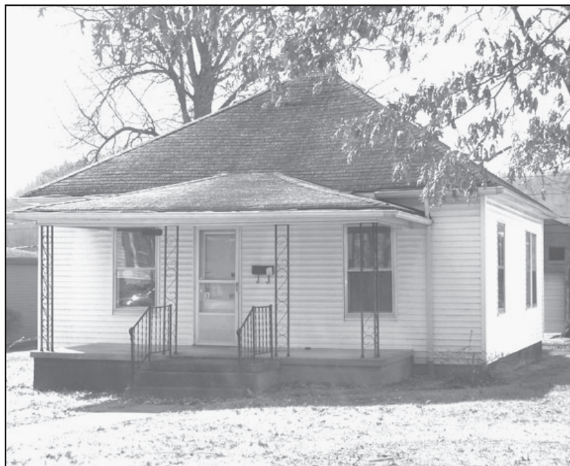
515 Elm Street, Ravenna, Ky.

AUCTIONEERS' NOTES: Extra nice level lot in good location. Would make a good starter home, retirement home or rental property. Call for more information or inspection of property.