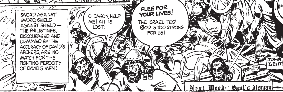
SAVE THIS FOR YOUR SUNDAY SCHOOL SCRAPBOOK