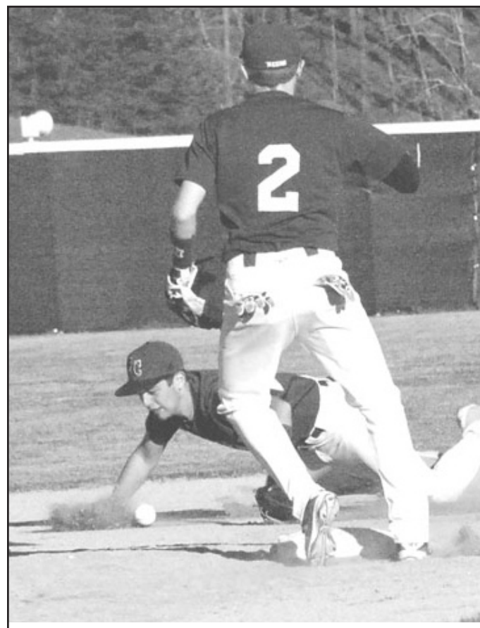
Estill Engineers knock down a hit by the Berea Pirates during last week's action.