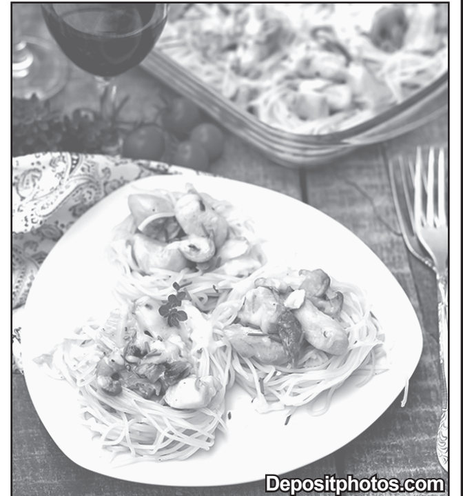
Chicken Tetrazzini with Spring Peas Casserole

If you prefer a "do-it-yourself" gift box, why not give Mom a casserole that you make yourself? Try my recipe for Chicken Tetrazzini with Spring Peas Casserole, and give your Mom a night off from the kitchen.