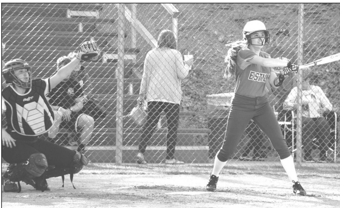
Estill Lady Engineers freshman outfielder watches her hit go out during a recent 13-0 win over the Owsley Lady Owls on Thursday, April 14th.