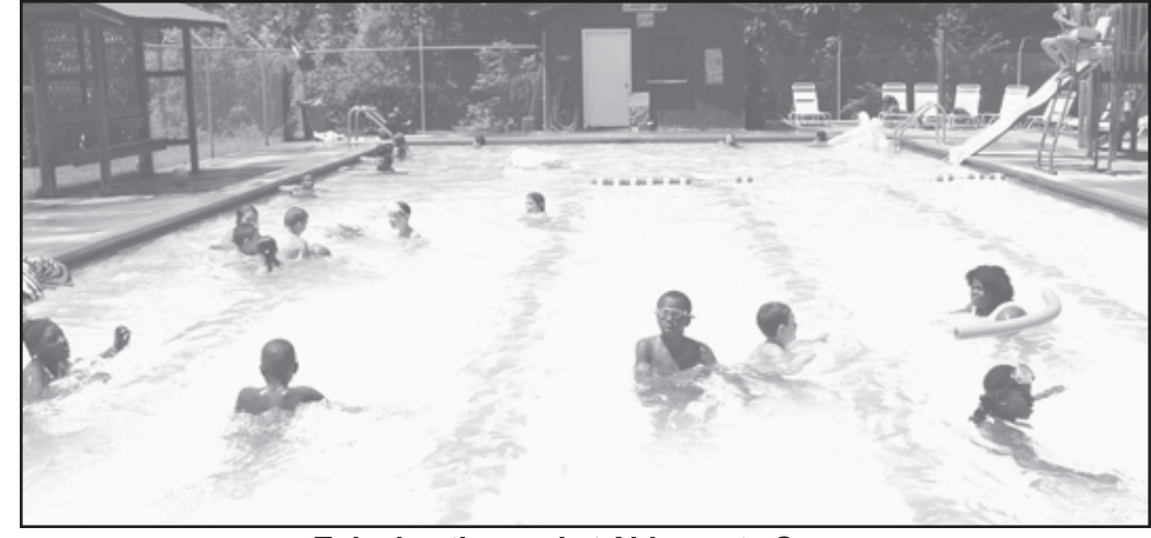
Enjoying the pool at Aldersgate Camp

tucky, Aldersgate is located Registration forms are the ghost town of Fitchburg in to intentionally provide for the Christian community within It will be a great way to start the natural beauty of God's creation by providing opportunities for people to come and enjoy the outdoors through activities such as hiking, gaga ball, swimming, playing in the ropes courses, crafts, animals,