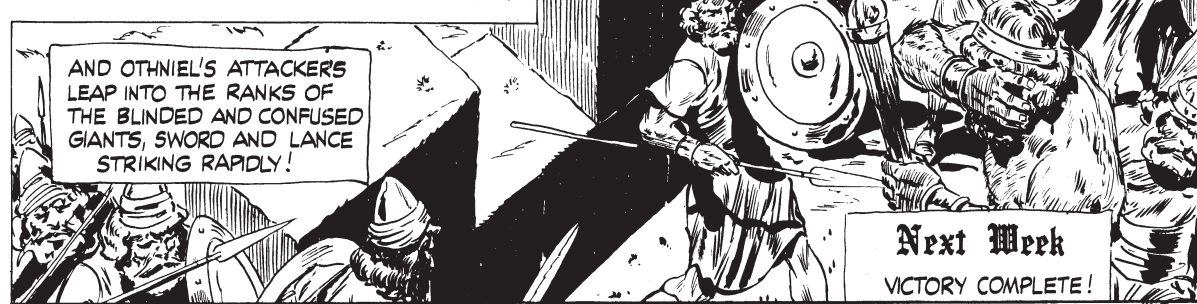
SAVE THIS FOR YOUR SUNDAY SCHOOL SCRAPBOOK