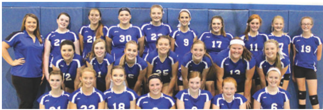
2016 Estill Lady Engineers Volleyball -- Page 14-15

Jay Bicknell's Wanderings from the Woods & Water Page 4