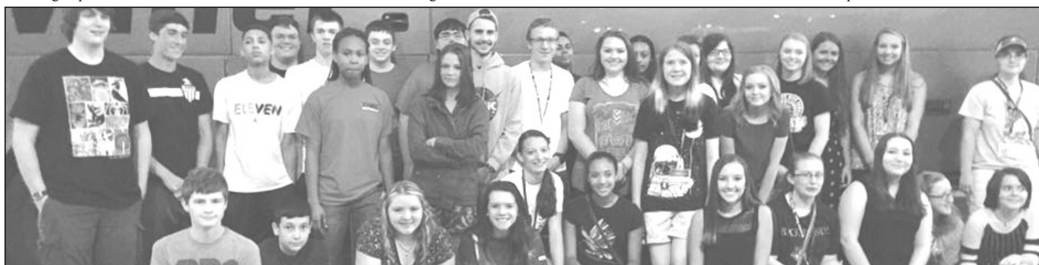
Educational Talent Search Participants Headed To Chicago