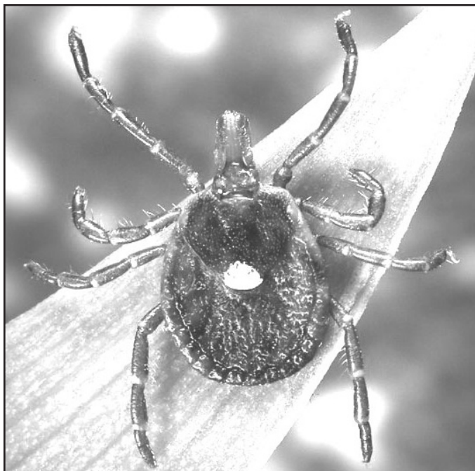
A female Lone Star tick

avoid or minimize time in tick habitats; 4) use personal protection - repellents (DEET or picaridin) or permethrin-based (Permanone) clothing spray; 5) inspect your clothing and body regularly and remove ticks, especially at the end of the day. Ticks wander on the body for some time before settling to feed. Often, they can be found before they become attached; 6) take a warm soapy shower after potential tick exposure; and 7) wash clothing in hot water and detergent - store in sealed bag until it is washed. Barbed mouthparts and cement secreted as they feed cause ticks to be anchored firmly to the skin. Use fine-tipped tweezers to grasp the tick as close to the skin surface as possible. Then, pull upward with steady, even pressure. The longer the tick has been in place, the harder it is to remove. Twisting or "unscrewing" the tick may cause the mouthparts to break off and remain in the skin. After removing the tick, thoroughly disinfect the bite site and wash your hands with soap and water.