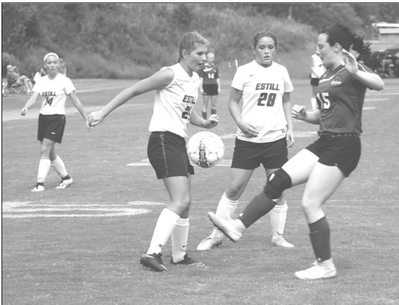
The Estill County Lady Engineers defend against Letcher County Central on Saturday. Estill's girls fought hard but lost 1-0 on a heartbreaking goal at 56 seconds by Letcher. Estill made a run at the goal but could not score as time ran out.

Estill Boys Soccer The Estill County Boys Soccer Team record now stands at 3-7 after a thrilling penalty kick/shootout victory against Wolfe Co. (8-7) and disappointing loss to last years region champ, Letcher Co. Central by the score of 3-2. Plenty of season left for them also so come out and support the Engineer Boys Soccer Team Estill Volleyball The Estill County Girls Volleyball Team record stands at 4-12 after stringing together two wins against Jackson City and Danville. Only one more home game for the Lady Engineers, so come out and show your support!