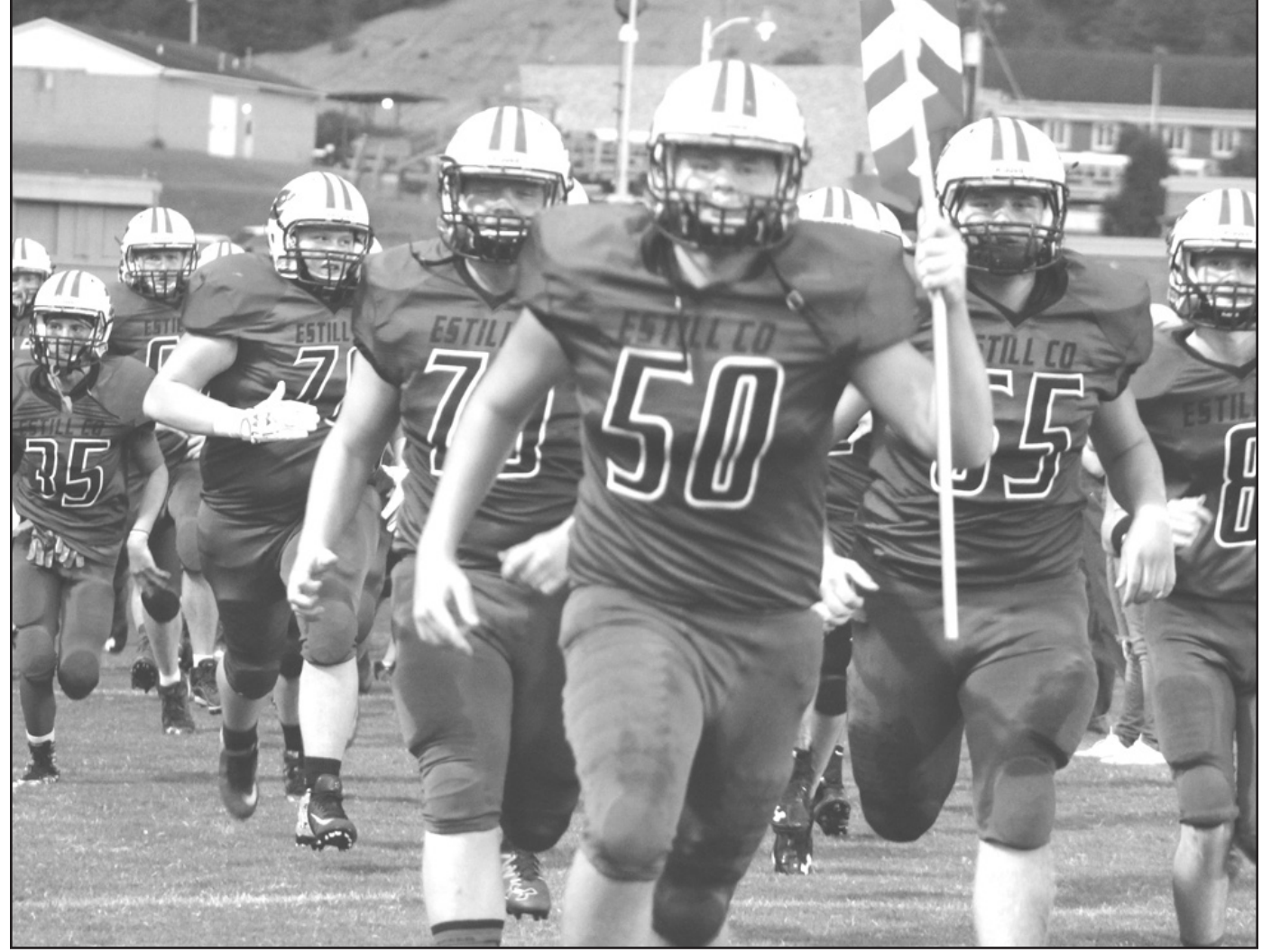
The Engineers stormed the field on Friday night ready to take on the Gallatin County Wildcats. The Engineers led the entire game and defeated the Wildcats with a final score of 53-23.