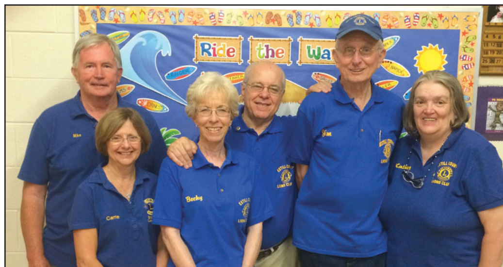
"The Estill County Lion's Club provided vision benchmark screenings for all 3rd and 5th grade students at West Irvine Intermediate on Thursday, September 8. West Irvine Intermediate is extremely grateful for their service and the quality vision exams provided to our students."