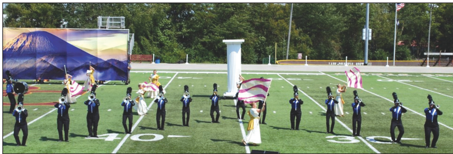
Estill County Engineers Marching Band at Bourbon County