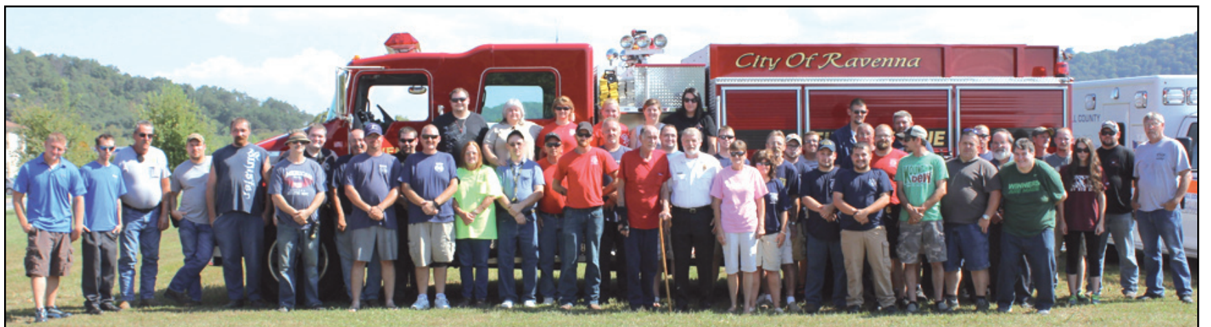
Volunteers attending the Appreciation Picnic in Ravenna on Saturday gathered in front of Ravenna's Fire Truck for a photo. The volunteers include firefighters and rescue squad members. Irvine