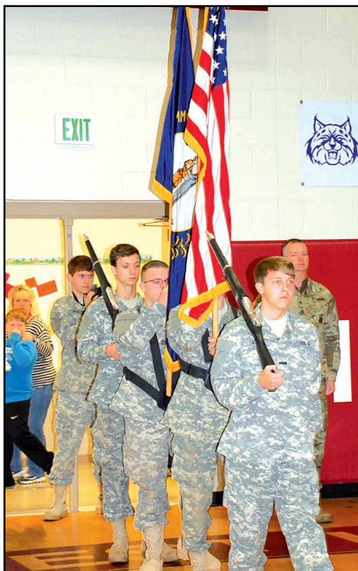
The award-winning ROTC from Estill County High presented colors during a Veterans Ceremony at West Irvine Intermediate on Thursday and at the high school on Friday.