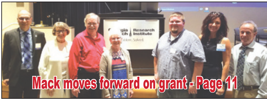
Mack moves forward on grant - Page 11

2 Weeks Until Breakfast with Santa Page 15