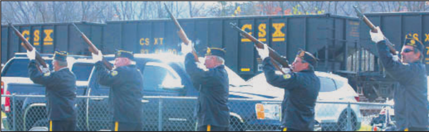
The Honor Guard from American Legion Post 79 performed a 21-gun salute during the Veterans Ceremony at Veterans Memorial Park in Ravenna on Saturday. The group also performs a 21-gun salute at graveside services of deceased veterans.