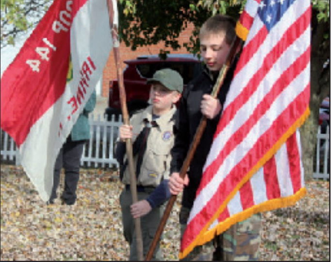
Boy Scout Troop 144 presented colors on Saturday, at the Veterans Day ceremony at Veterans Memorial Park in Ravenna.