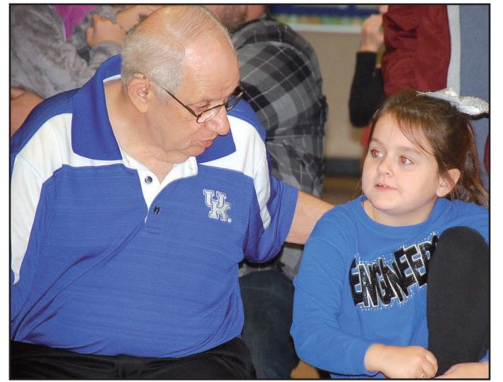
A veteran at West Irvine's ceremony on Thursday met with a student later. The students were allowed to spend time with their veteran relatives.