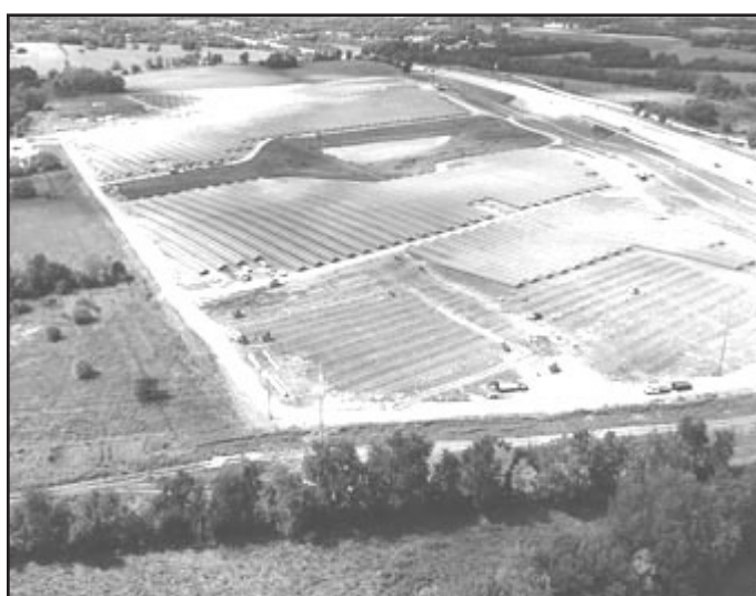
The Cooperative Solar Farm can be seen from I-64 and is now up and running.