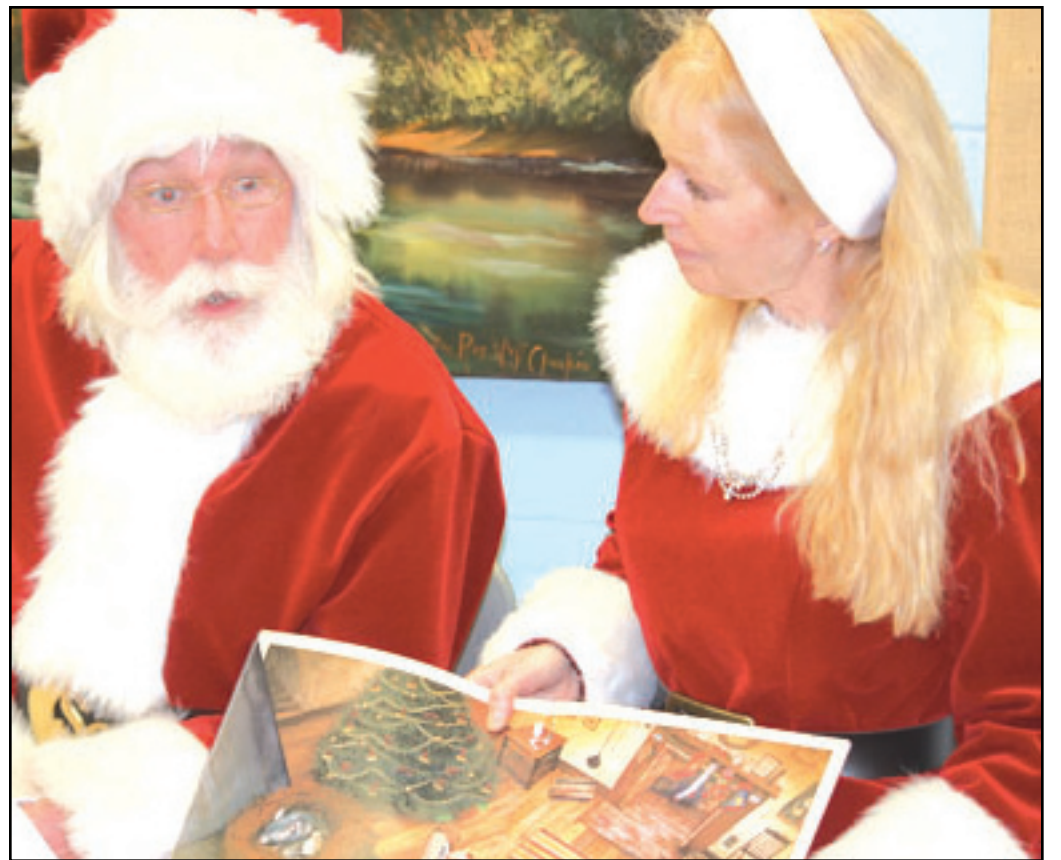
Santa looks really surprised as Mrs. Claus reads "The Night Before Christmas" to preschoolers during Storytime at the library on Friday.