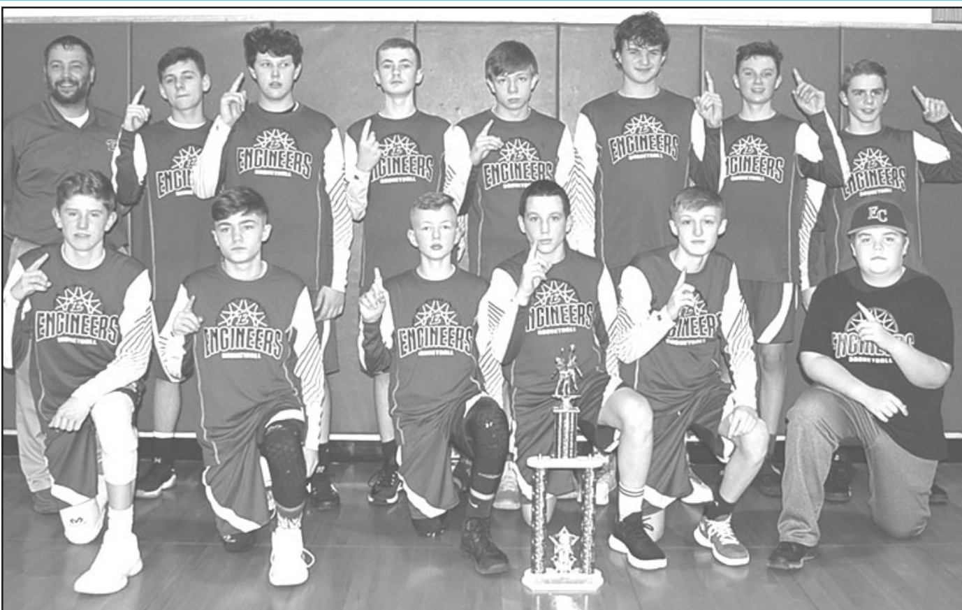
2017 56th District Tournament 8th Grade Champion - Estill County Engineers