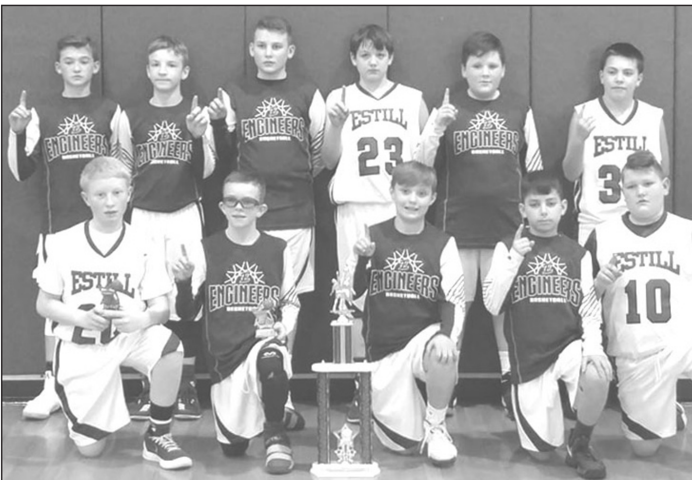
2017 56th District Tournament 6th Grade Champion - Estill County Engineers