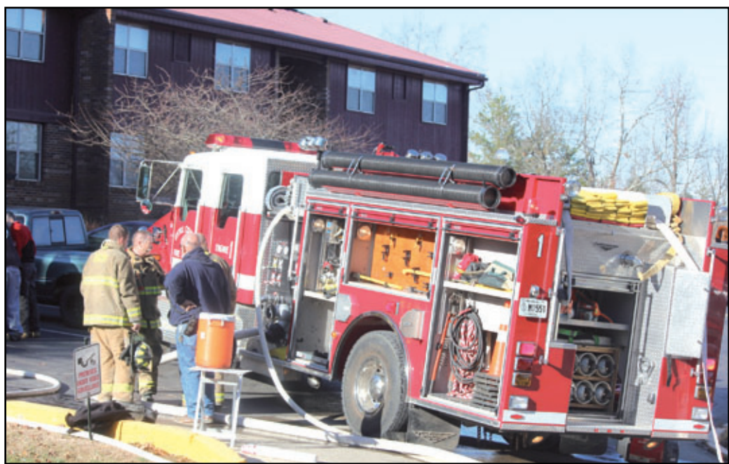
Firefighters quickly knocked down an apartment fire at Stacy Lane on Monday. The apartments are close to the county fire station.

The Estill County Fire Department was called to an apartment fire at Stacy Lane Apartments around 1:37 p.m. on Monday.