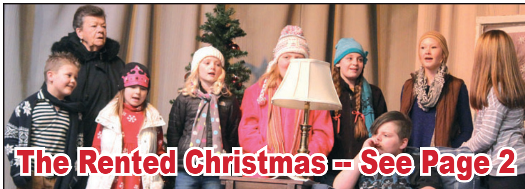
The Rented Christmas -- See Page 2