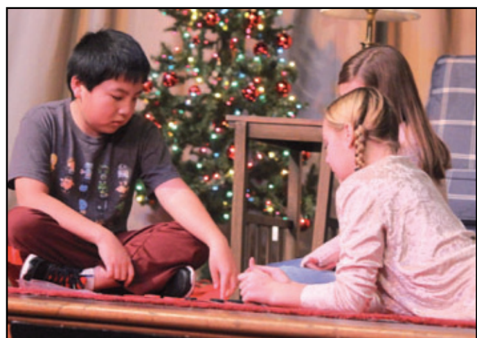
The children "rented" for Christmas played games during Sunday's production of "The Rented Christmas" by River City Players.