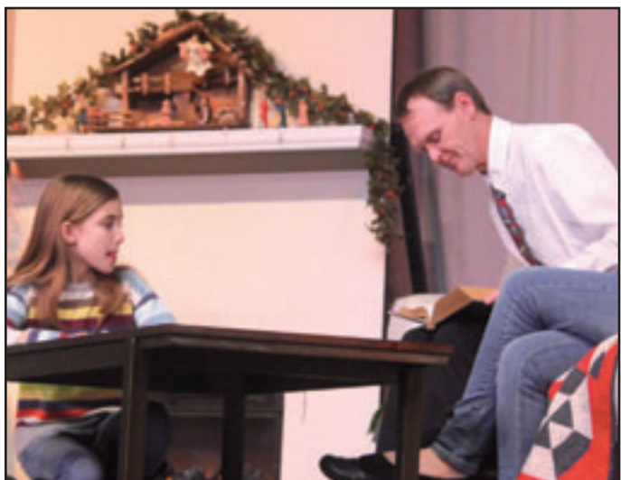
came from the local orphanage.