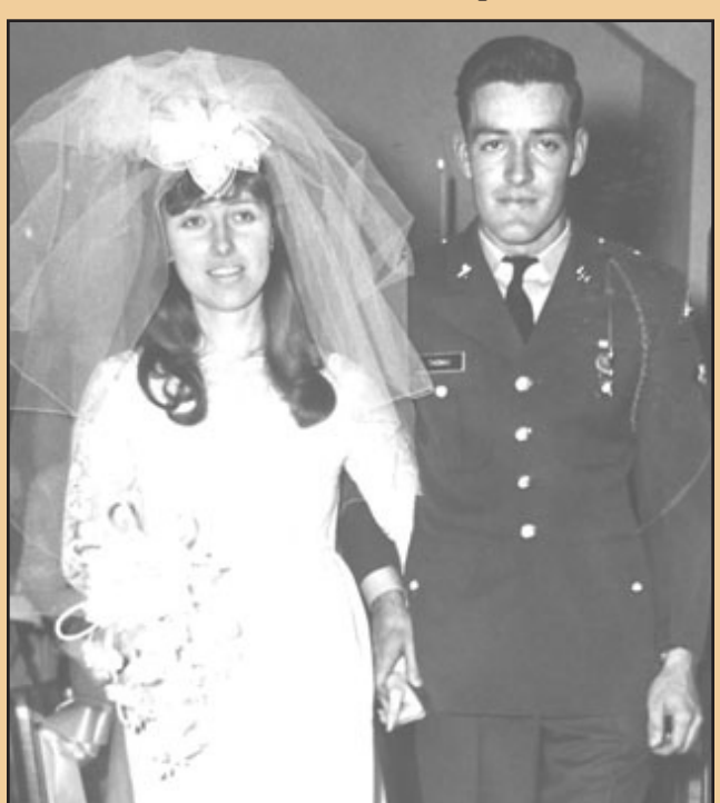
December 16, 1967

All friends and rela-They were married tives are invited to attend