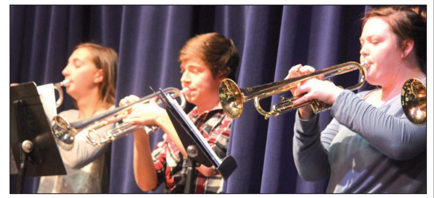
The Estill High concert band played before and during River City Players' production of "The Rented Christ-