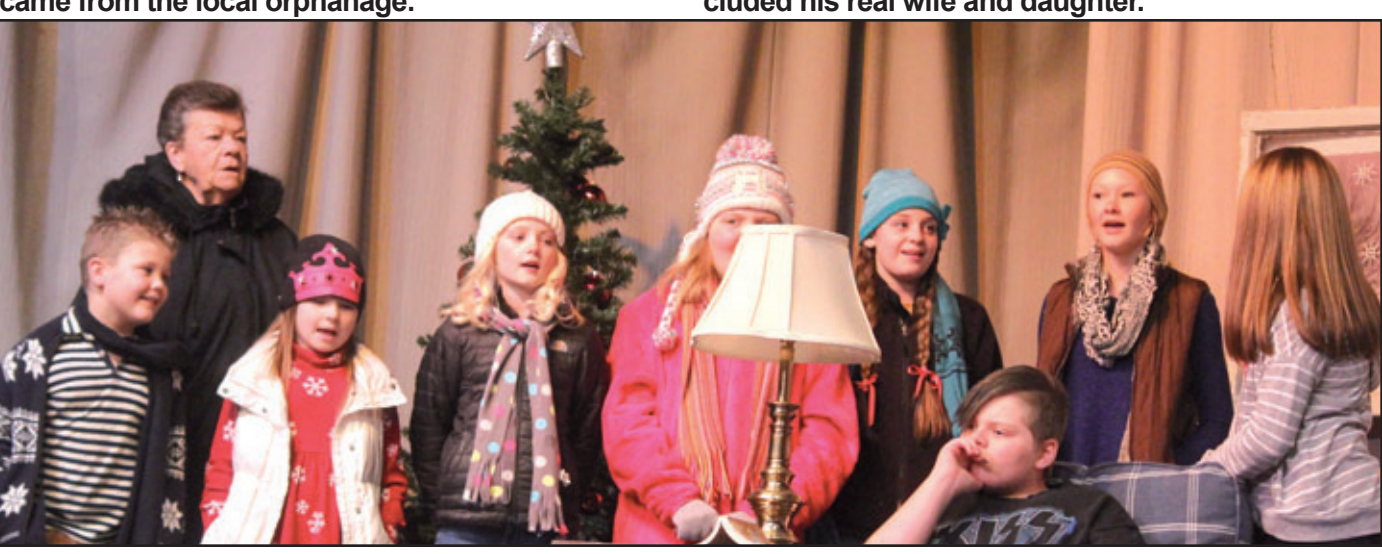
Orphans were chosen as carolers to sing at the home where Christmas was being rented.