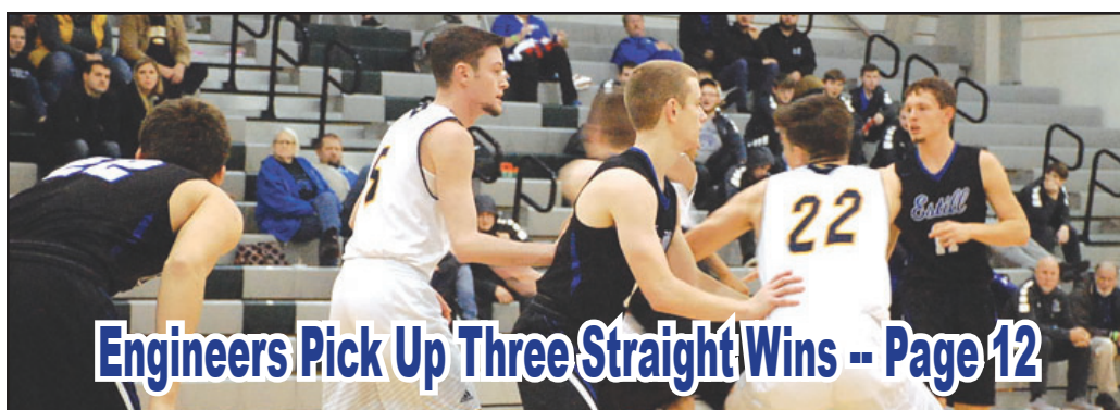
Engineers Pick Up Three Straight Wins -- Page 12

Estil Lady Engineers looking to improve Page 12