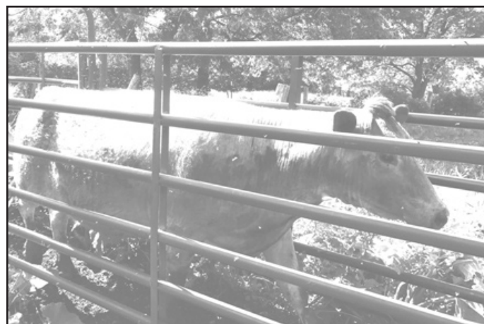
Dirty Brown Cow is pre-hamburger

E-mail: birdingbits@cfj.rr.com © 2011 King Features Syndicate, Inc.