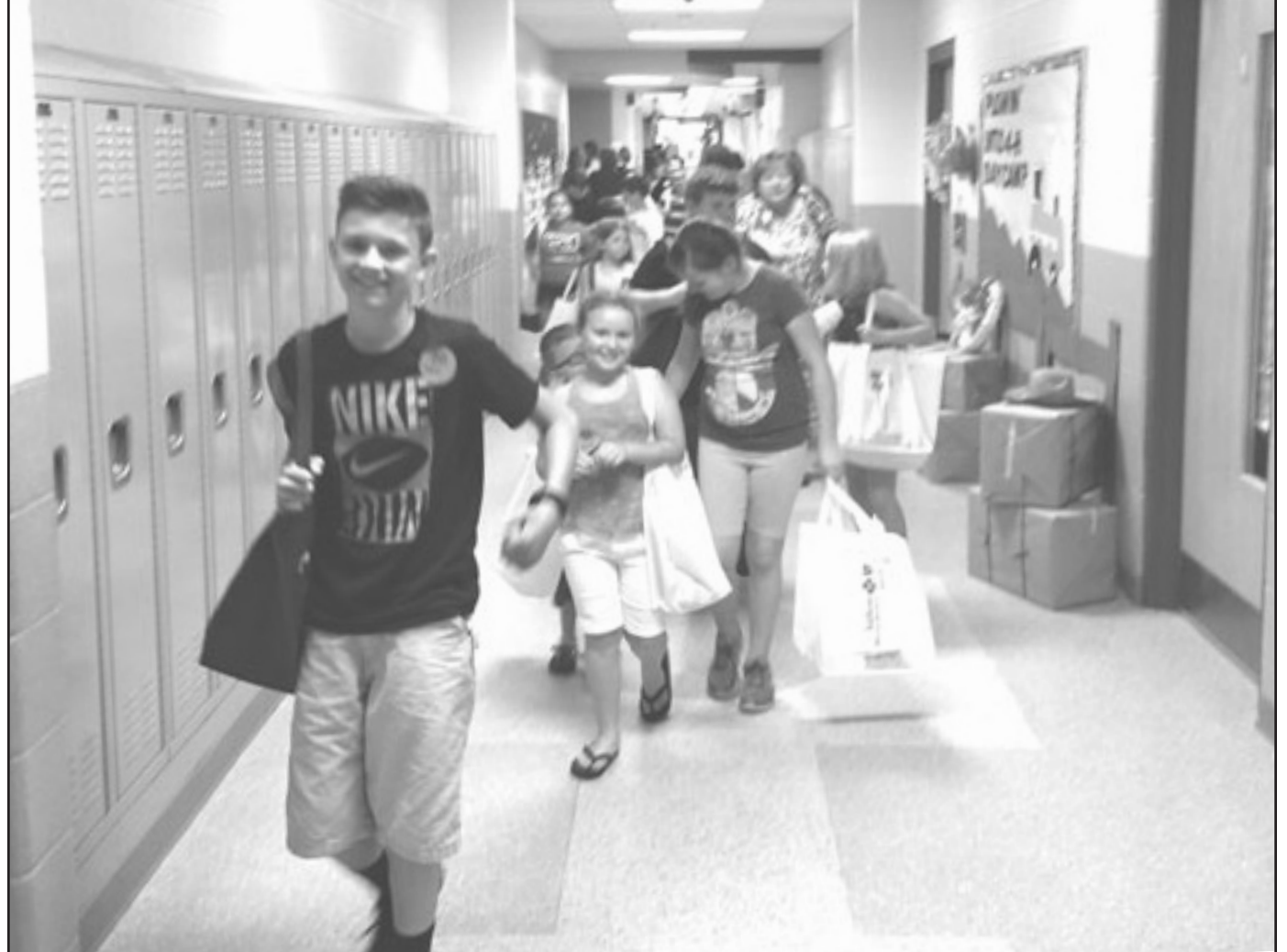
Estill County 4-H Fun on the Farm Day Camp