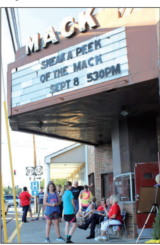
building in 2016, applied for a brownfields grant and received it for $200,000 to clean up lead paint and asbestos.