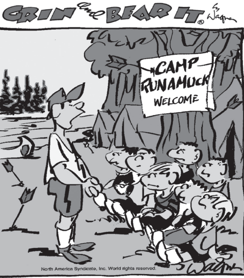
"First, a moment of silence for the archery instructor."

Mail with $10 entry fee to the Estill County Agrl. Fair Board, P. O. Box 361, Irvine, KY 40336 Attn: Baby Show - Make checks payable to: Estill County Agrl. Fair Board or Clip this form and bring with $10 entry fee to the Estill County Farmers Market