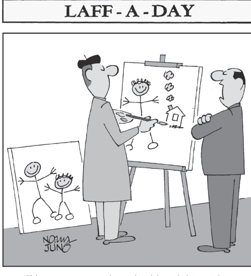
"Have you ever thought this might not be your line of work?"