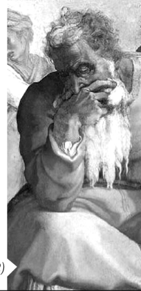
Detail of "The Prophet Jeremiah" by Michelangelo (1508-1512)

You who know, O Lord, remember me, take notice of me, and take vengeance for me on my persecutors. Do not, in view of Your patience, take me away; know that for Your sake I endure reproach. Your words were found and I ate them, and Your words became for me a joy and the delight of my heart; for I have been called by Your name, O Lord God of hosts. Jeremiah 15:15,16