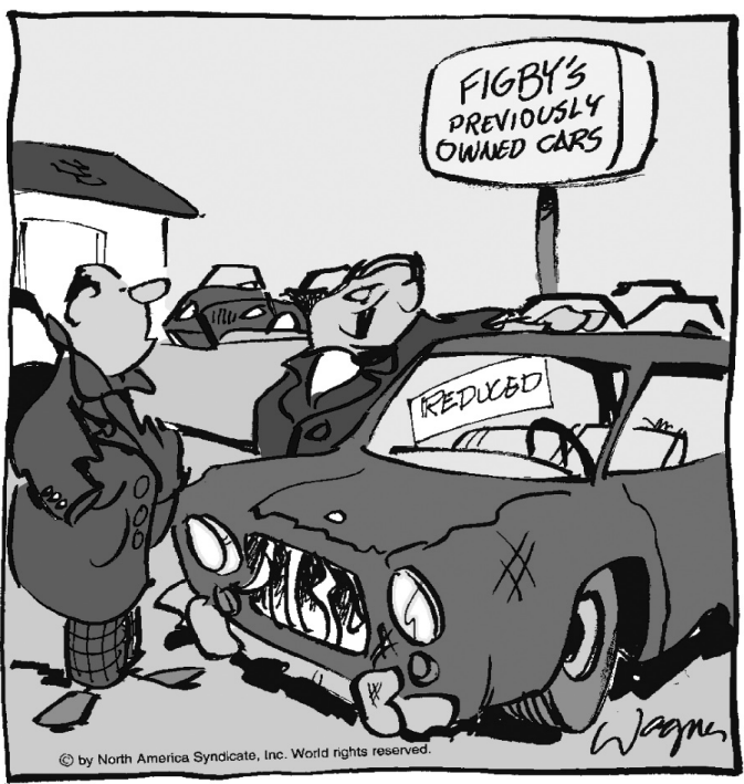
"Of course you can test-drive it ... Let me get the jumper cables."