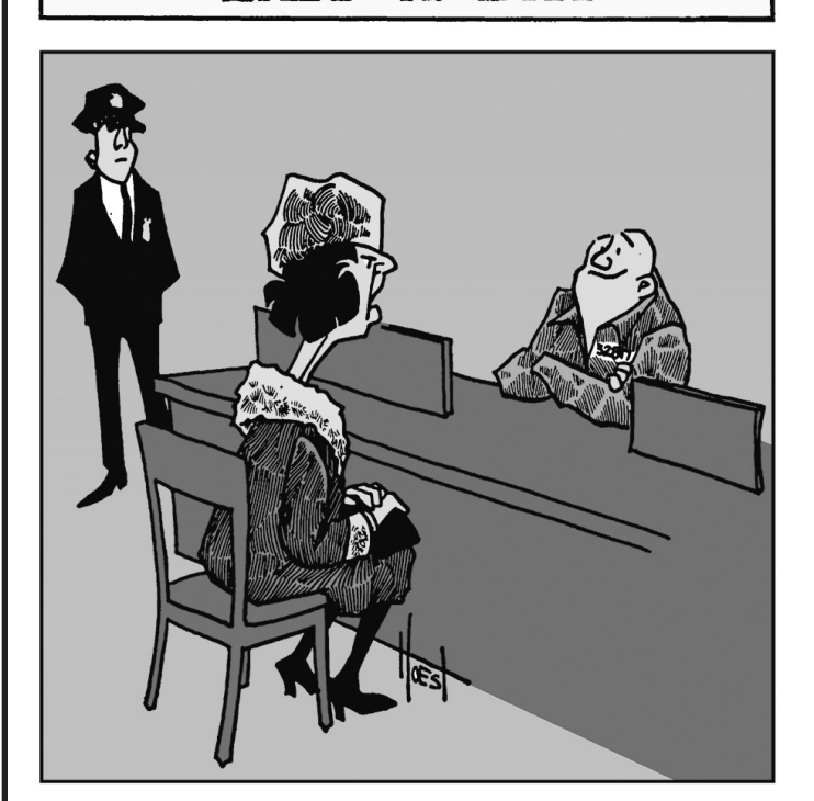
"What do you mean, you signed up for another ten years?"