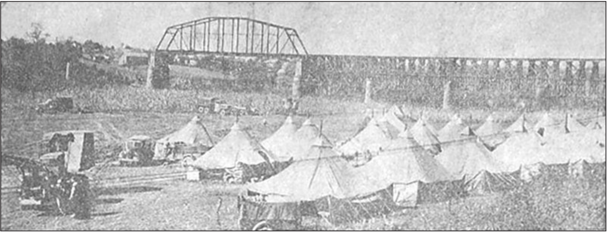
SCRAP HUNTERS BIVOUAC in this miniature army camp of a detachment of the 383rd Engineers from Fort Knox who will tackle the man-size job of blowing down a 200-ton railroad bridge in Irvine, Ky., to go into Kentucky's scrap campaign. The 1,000-foot bridge and trestle are in the background.