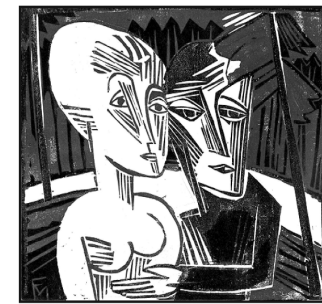
"Couple in the Forest" by Conrad Felixmüller (1918)

An excellent wife, who can find? For her worth is far above jewels. The heart of her husband trusts in her, and he will have no lack of gain. She does him good and not evil all the days of her life.