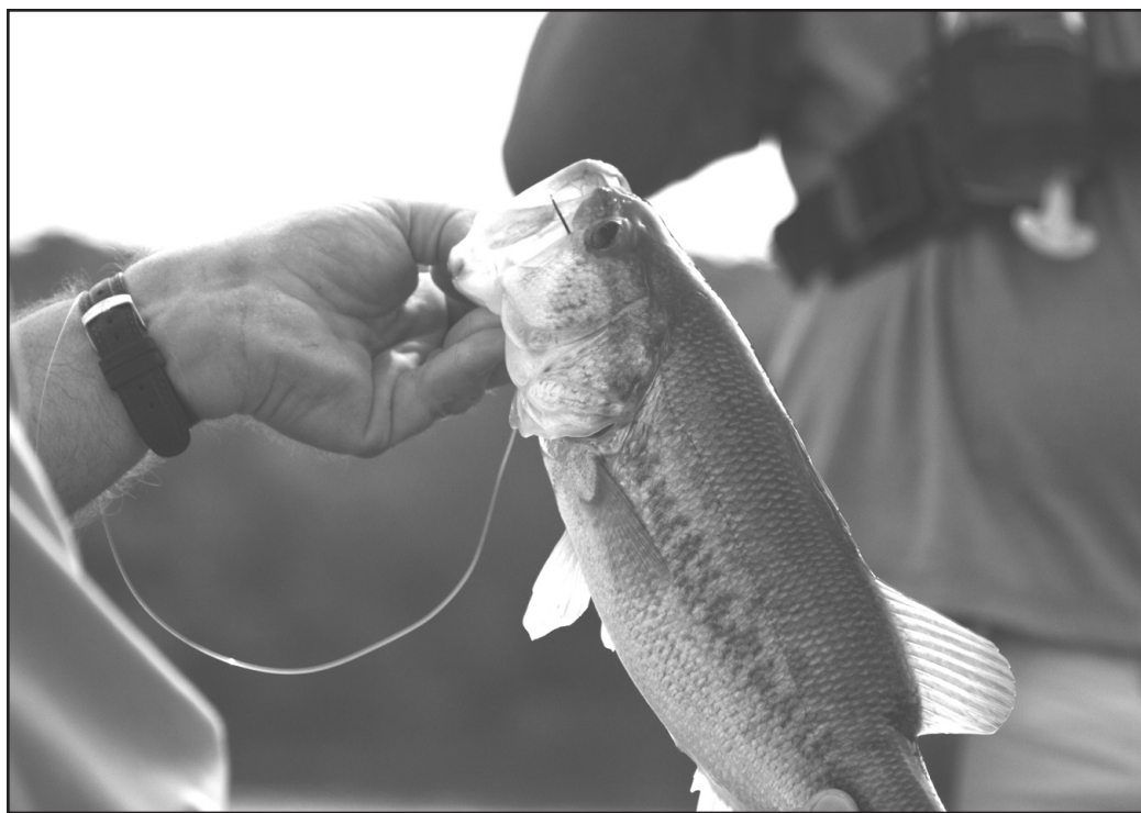
Finding a place to catch largemouth bass, like this one from Kentucky Lake, or other fish species is much easier using the tools available free on the Kentucky Department of Fish and Wildlife Resources' website at www.fw.ky.gov .