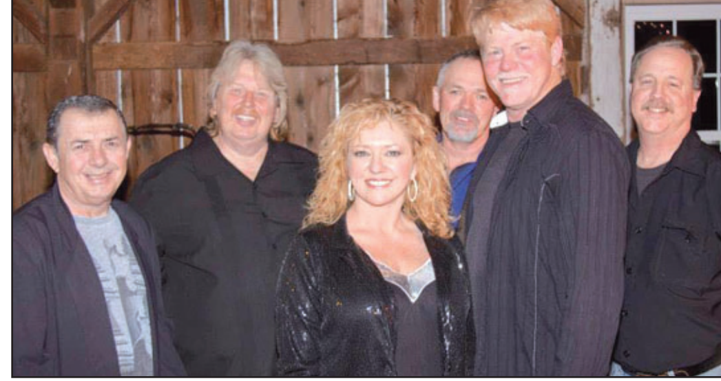
Faded Blue Band will be performing Friday at Picnic in the Park, at Veteran's Memorial Park in Ravenna. Picnic in the Park is a fundraiser for River City Players. Admission is $10 per person ages seven and over.

Tables for the event have available. Children six and