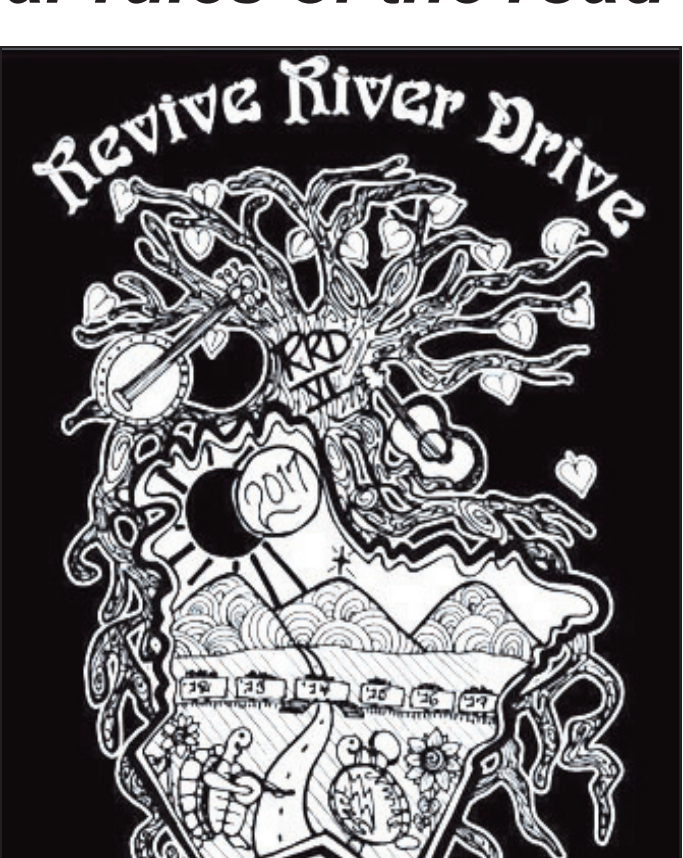
Above is this year's new design for T-shirts. T-shirts

The first annual Color Run/Walk sponsored by the Estill County High School cheerleaders will be held on Saturday morning. Registration begins at 7:30 a.m. with the 2K color walk starting at 8:30. The 5K color run will begin at 9:00.