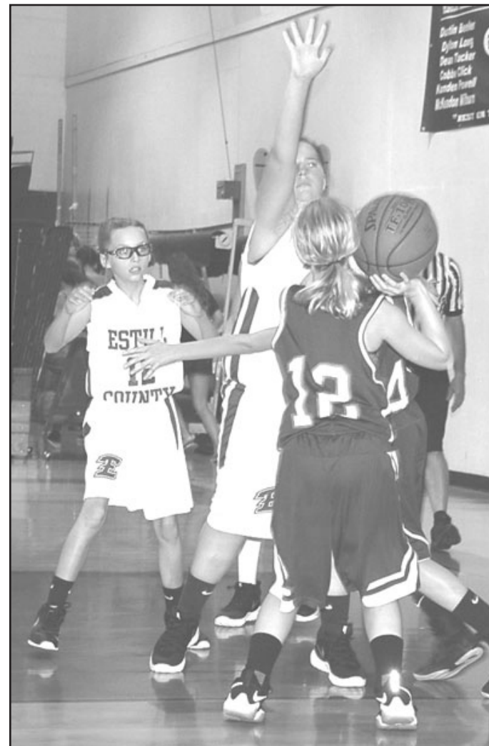
BELOW: A Model Lady Patriot tries to shoot over Estill's 6th grade defense.