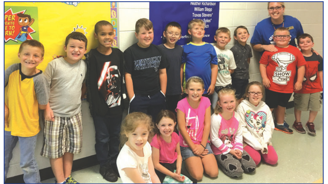
These Estill Springs students had Exemplary Attendance in the 2016-2017 school year