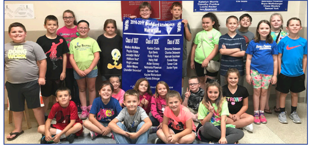
These West Irvine students had Exemplary Attendance in the 2016-2017 school year