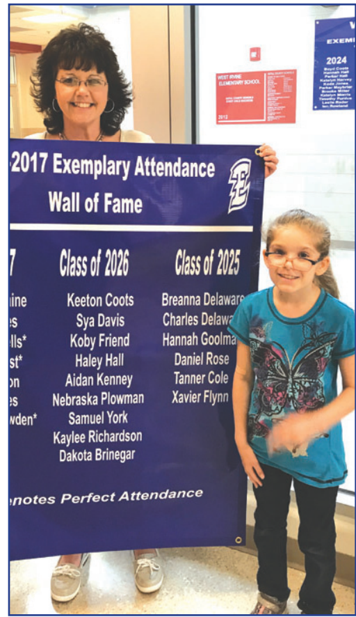
West Irvine students had Exemplary Attendance for the 2016-2017 school year.