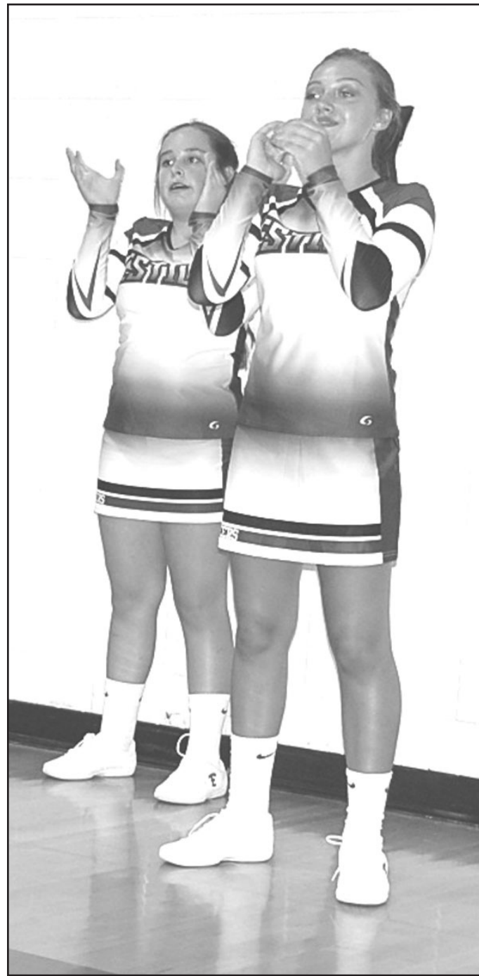
Estill County Middle School cheerleaders cheered on the Lady Engineers against Powell County on Monday night at Estill.