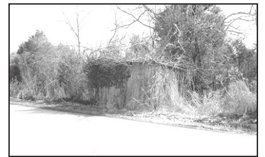
Recent view of the remains of the old Cedar Grove Voting House, located directly across the old road from the Garage.

For many years Cedar Grove had a Voting House for the Cedar Grove prescient. It is unknown when it was established and discontinued. In later years it was located near the Sand Hill Road across from the Cedar Grove Church. The old vine covered building still stands.