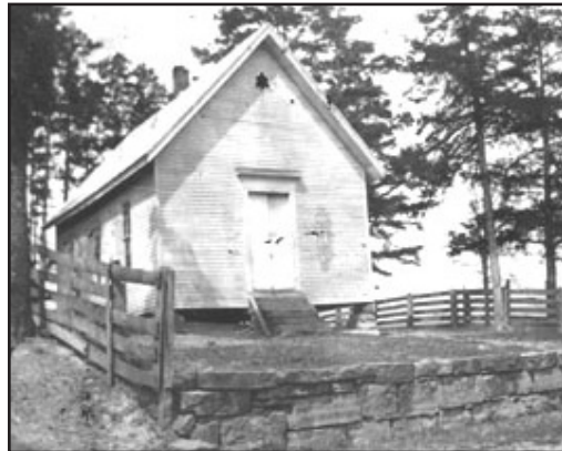
The early 1881 Church Building (above) and the new Sanctuary built sometime after 1920 (below), with the original building moved behind and turned sideways to accommodate Sunday School Rooms and other activities.