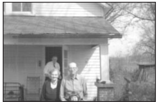
And Early Clear Creek School.