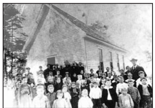
Early Cedar Grove School.