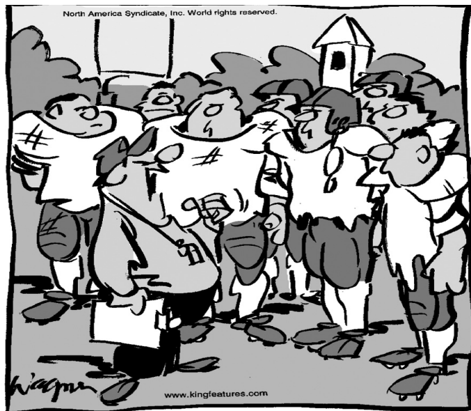
"It's my job to instill some confidence in you losers!"

E-mail: birdingbits@cfl.rr.com © 2014 King Features Syndicate, Inc.