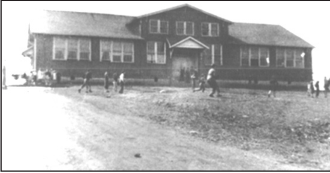
Old West Irvine School House