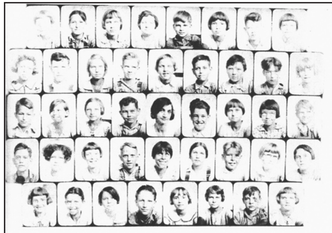
West Irvine School Group 1929-30, Identified from left to right.