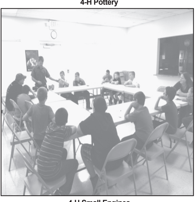
4-H Small Engines

Educational programs of Kentucky Cooperative Extension serve all people regardless of economic or social status and will not discriminate on the basis of race, color, ethnic origin, national origin, creed, religion, political belief, sex, sexual orientation, gender identity, gender expression, pregnancy, marital status, genetic information, age, veteran status, or physical or mental disability.