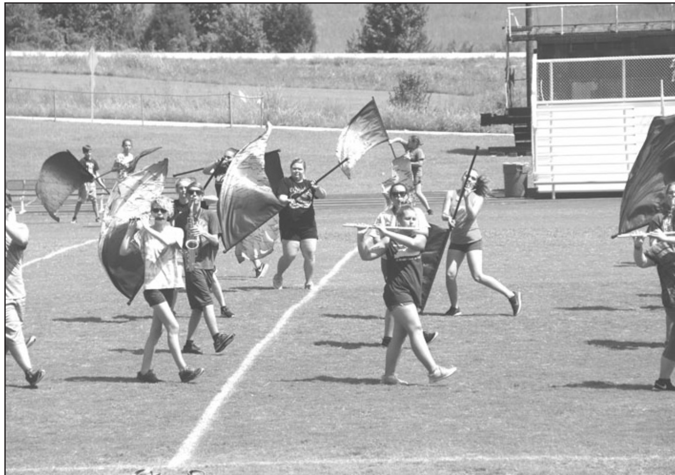
The Marching Engineers practiced "The Black Death" on Monday afternoon.

er it be preparing food, altering uniforms, or building props. Parents were on hand on Monday afternoon building props for the show while the kids were practicing on the field. They will perform their show for the first time during halftime at the football game on Friday night. He said that there will also be several competitions close by in Madison County and in Powell County so friends and family members will be able to attend.