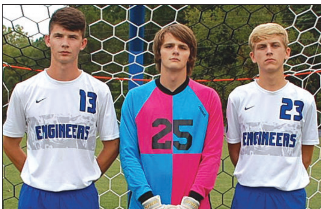
2017 ENGINEERS SOCCER SENIORS

Just as we all own the problem of childhood obesity, we must all be part of the solution. There are as many approaches as there are communities, partner organizations and advocates.