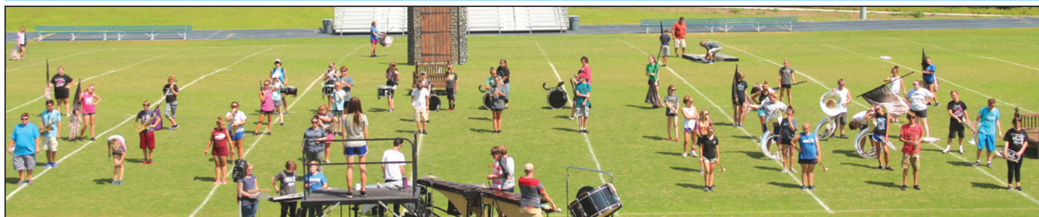
2017 ESTILL COUNTY MARCHING ENGINEERS