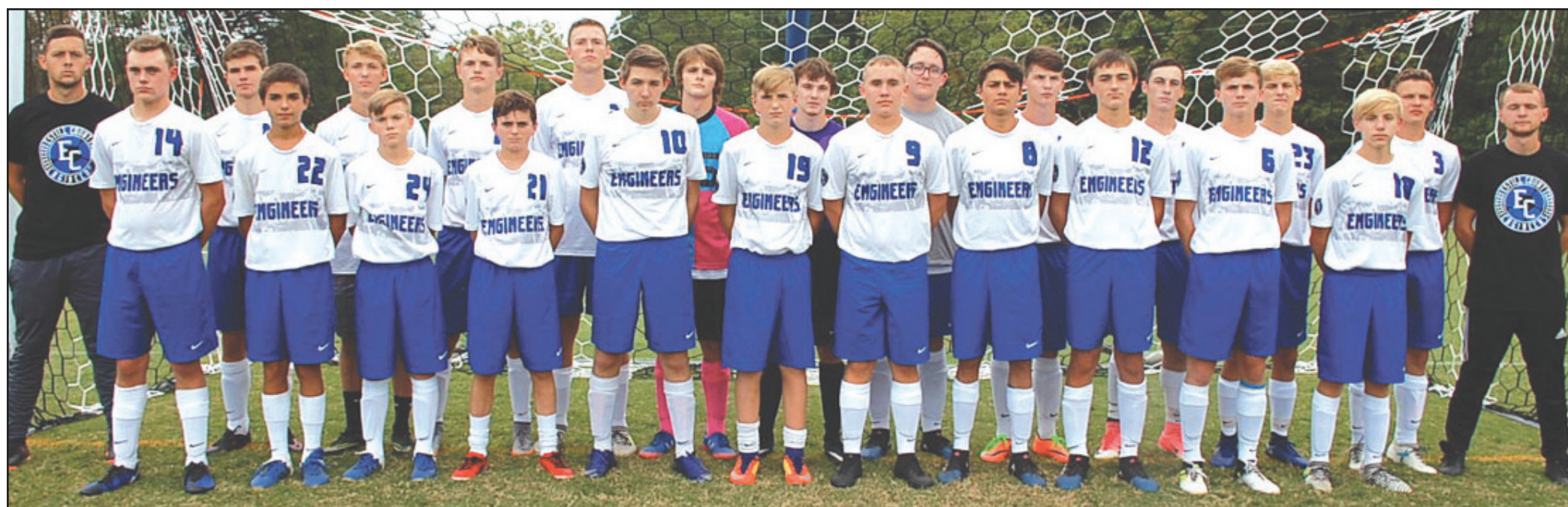
2017 ESTILL COUNTY ENGINEERS BOYS SOCCER