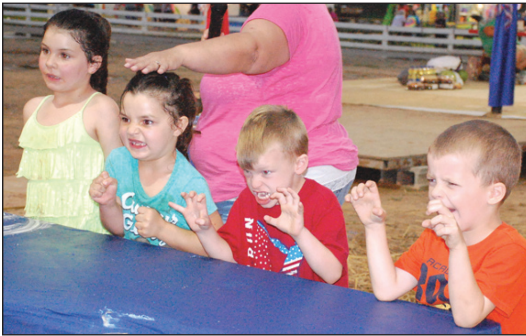
Competition was fierce in "The Ugly Man Contest" on Wednesday night during the 2015 Estill County Fair.