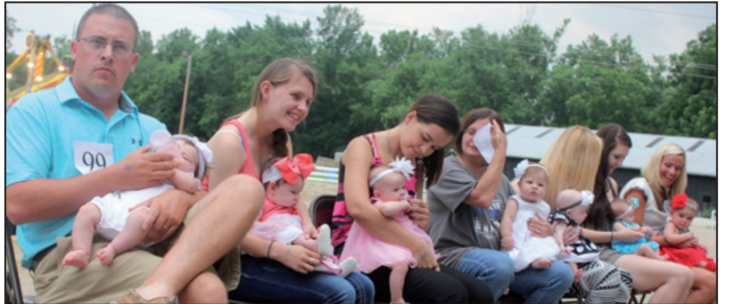
Entries in the girls under 6 months class.