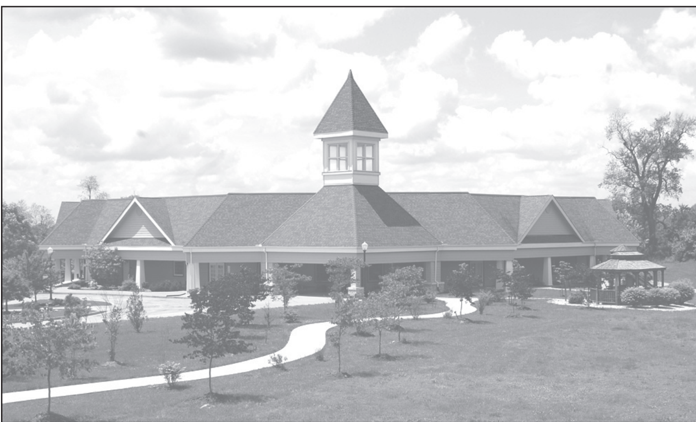
The Hospice Care Plus Compassionate Care Center is celebrating its 10th anniversary with a special event on Friday, October 12, 2018. The Center opened in 2008 as only the 2nd freestanding, hospice inpatient facility in the state.

Due to President Trump's planned visit to Richmond on Saturday, the "Decade of Compassion: Celebrating 10 Years of the Compassionate Care Center" event has been rescheduled. The Decade of Compassion celebration will take place on Friday, October 12, at 6 p.m. at the Compassionate Care Center. Reservations are available by contacting Hospice Care Plus at 859-986-1500 or hospice@hospicecp.org .