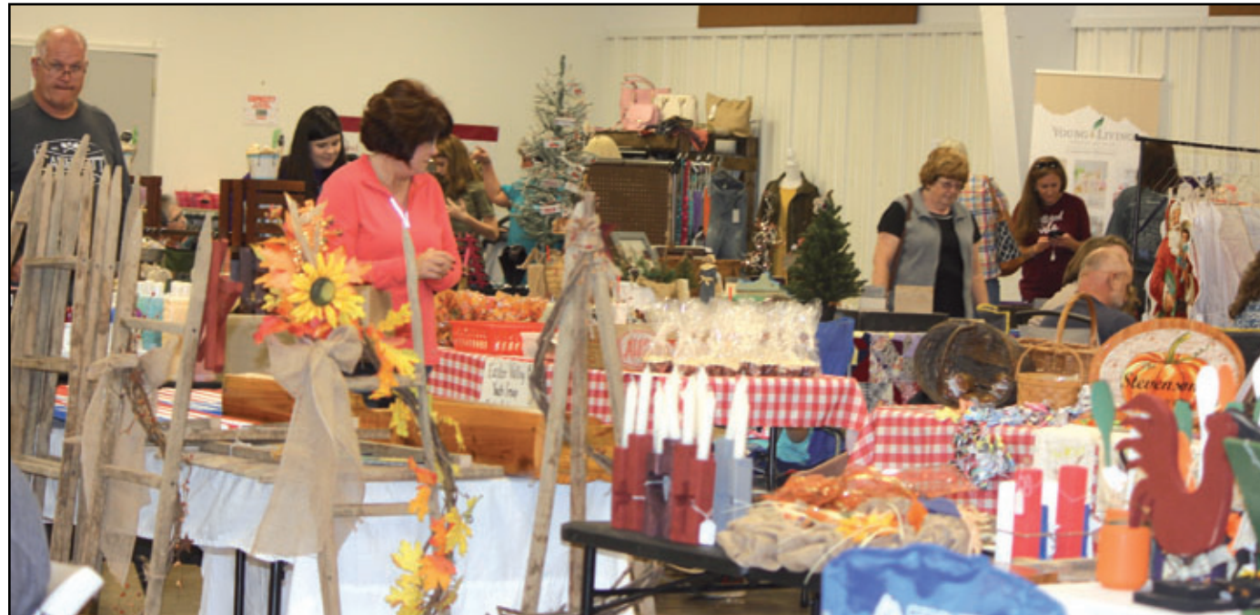
Customers looked over crafts and other merchandise during Main Street Market held Saturday at the Estill County Fair Barn.