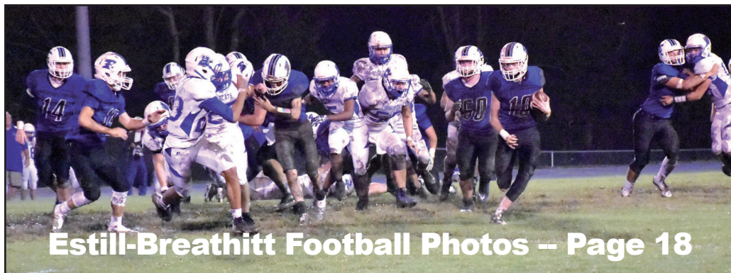
Estill-Breathitt Football Photos -- Page 18

Jay Bicknell's Wanderings from the Woods & Water Page 15