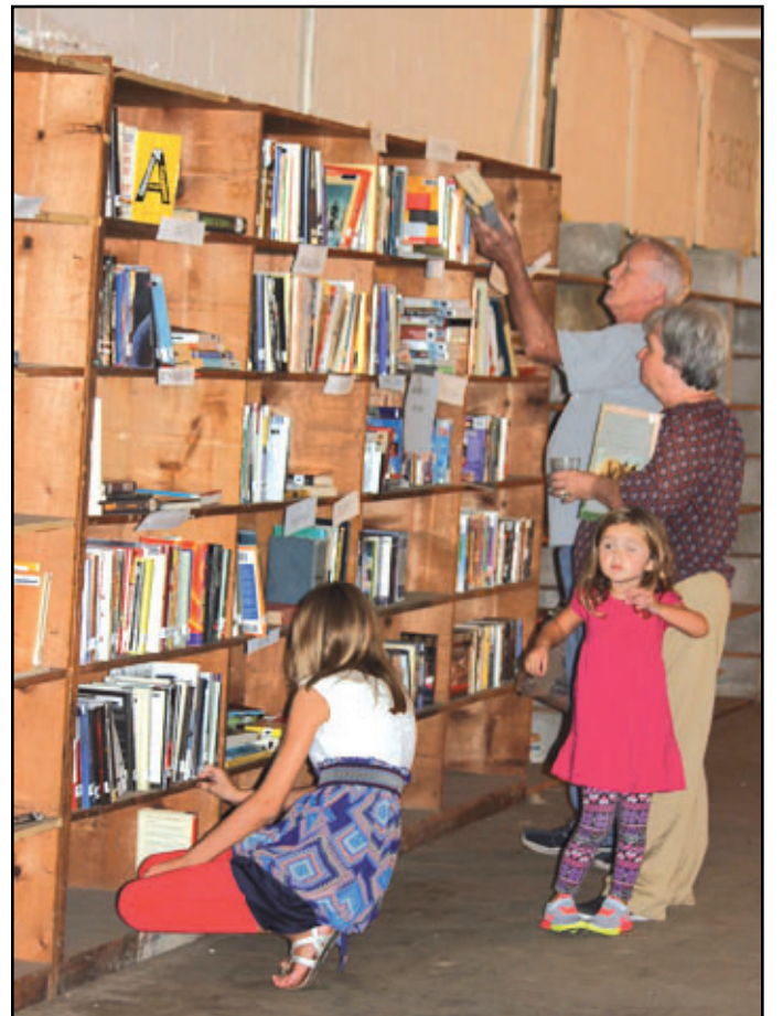
The Estill County Library opened the Kroger building on Sunday afternoon to the public. Patrons could pick out free books and were given refreshments. They could also view the architect's plans to renovate the building into a library.