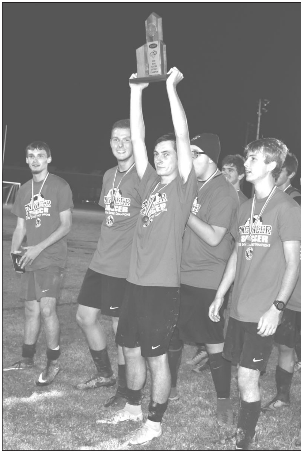
The Estill County Engineers Boys Soccer Team holds the 54th District Trophy up high for the loyal Blue to see after defeating Powell County in Stanton for the title.

The district is a 6-team district and two teams will be sitting out, likely Magoffin and KCC unless Knott can pull off a win over Estill.