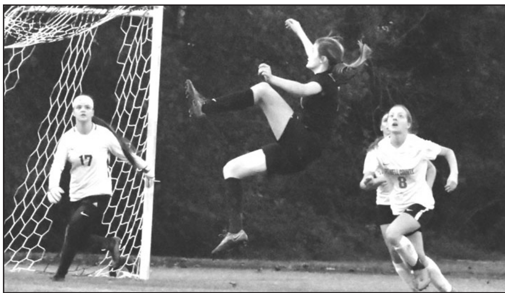
Estill Lady Engineers get a high kick against the Lady Pirates.