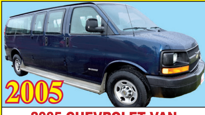
2005 CHEVROLET VAN 15-PASSENGER! LOCAL TRADE! LOADED! WE HAVE FINANCING!