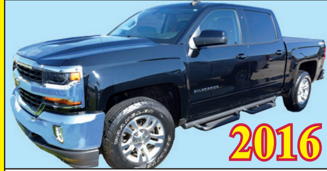
2016 CHEVY SILVERADO LT 4-DOOR! LOADED! LEATHER INTERIOR! 4X4! A VERY SHARP PICKUP! GOOD MILES!