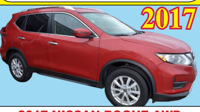
2017 NISSAN ROGUE AWD 4-DOOR! ALL WHEEL DRIVE! AUTOMATIC! LOADED! LOW MILES! FINANCING AVAILABLE!