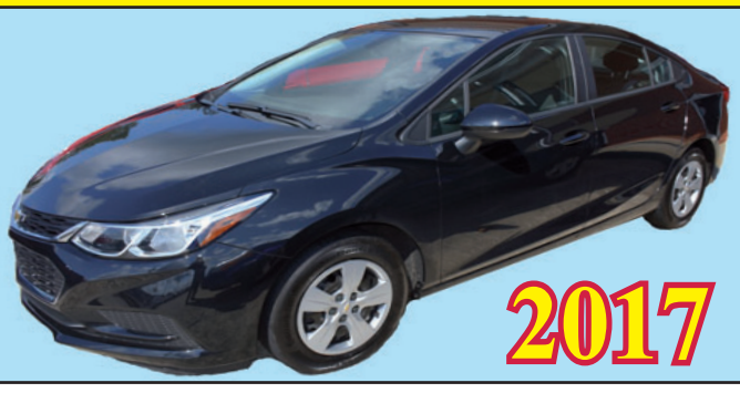
2017 CHEVROLET CRUZE LOADED! 4 DOOR! ONLY 12,000 MILES! FACTORY WARRANTY! WE HAVE FINANCING!