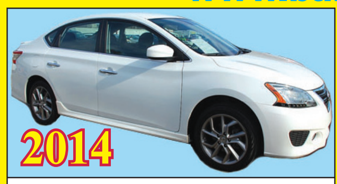
2014 NISSAN SENTRA SR 4-DOOR! LOADED! LOW MILES! FACTORY WARRANTY! WE HAVE FINANCING!