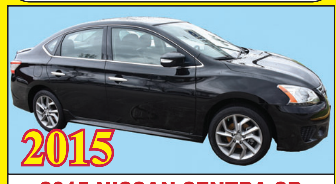
2015 NISSAN SENTRA SR 4-DOOR! LEATHER! MOON ROOF! LOW MILES! LOADED! FACTORY WARRANTY! FINANCING!