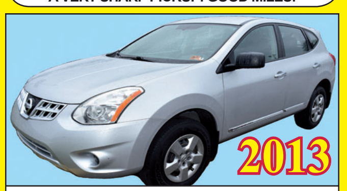
2013 NISSAN ROGUE AWD LOADED! ONLY 37,000 MILES! COME AND SEE! WE HAVE FINANCING!