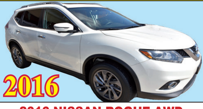
2016 NISSAN ROGUE AWD LEATHER! MOON ROOF! ONLY 18,000 MILES! FACTORY WARRANTY! WE HAVE FINANCING!