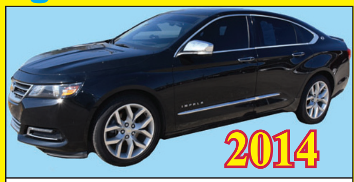
2014 CHEVROLET IMPALA LTZ 4-DOOR! LEATHER! MOON ROOF! LOW MILEAGE! ONE SHARP CAR! LOADED! LOW MILES!