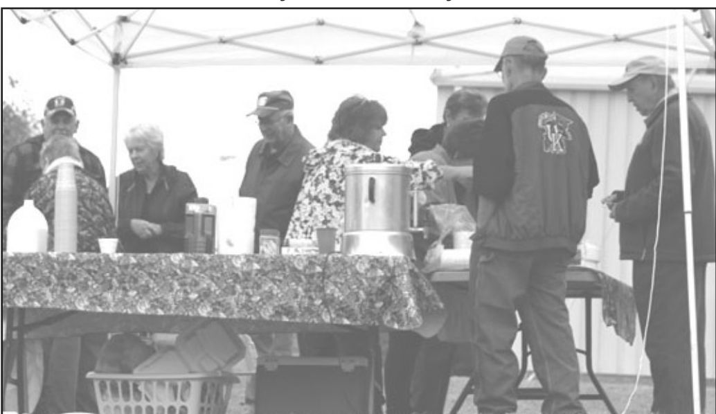
Historical society members serve a variety of old fashioned foods to guests at the Old Time Day, which is always open to the public.