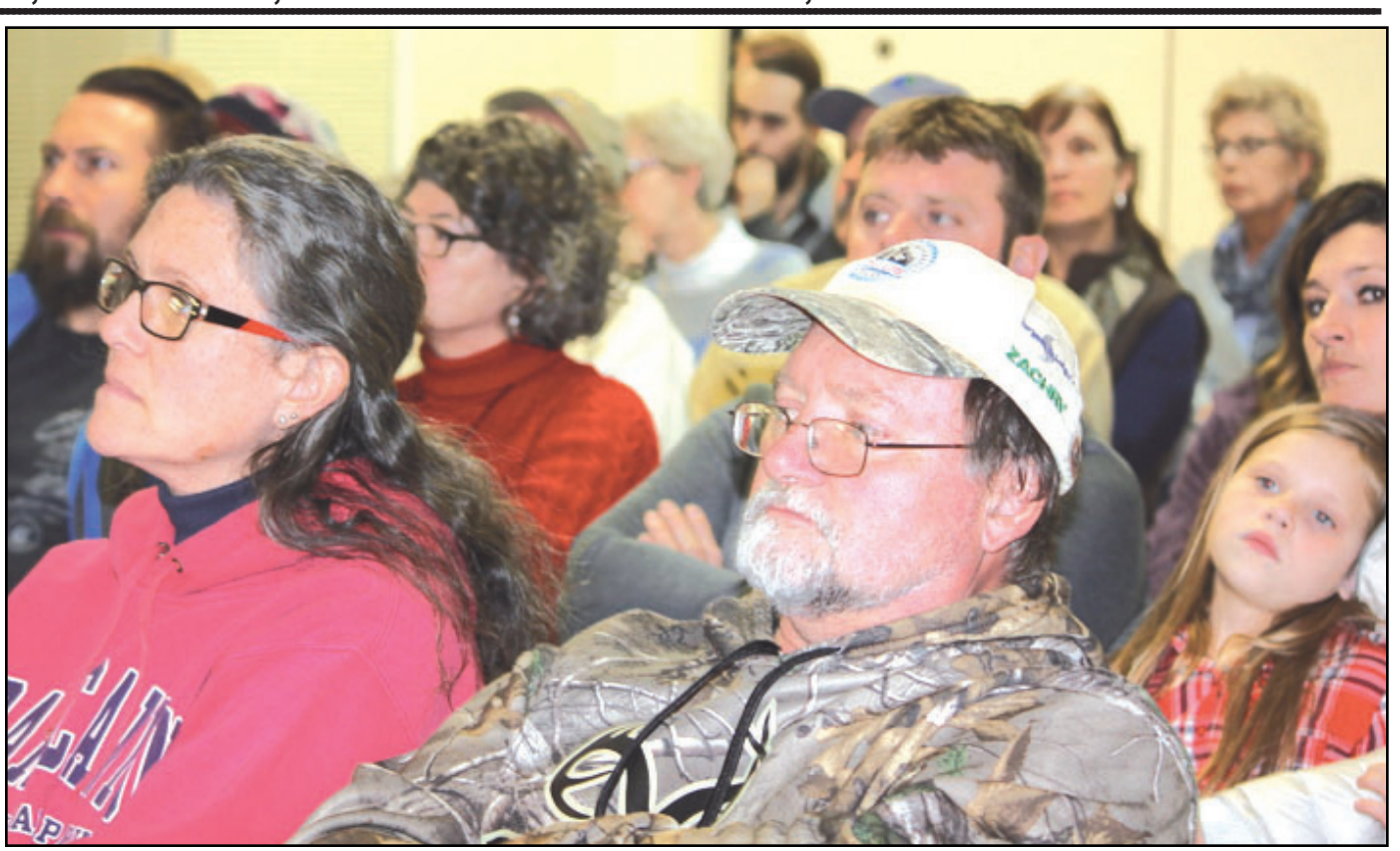
There was standing room only Monday as residents attended a meeting to learn about Advanced Disposal's Corrective Action Plan (CAP) on TENORM. The audience was not in favor of letting the radioactive material stay in Estill County, which the landfill says is the safest way to handle it.